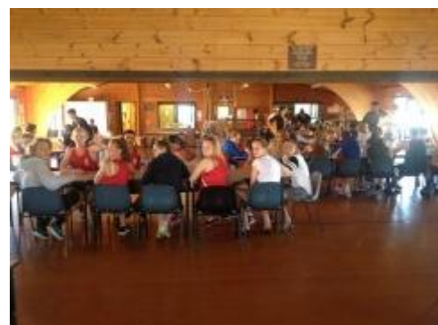
Group pictures of all swimmers on Tri series